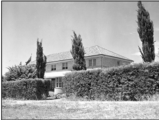
Russian Embassy around 1950

Both the Hotel Kingston and nearby Tobin Brother's Funeral Parlour are alleged to have been used as ASIO observation and listening posts. For a time, all those entering and leaving the grounds of the Embassy were recorded.